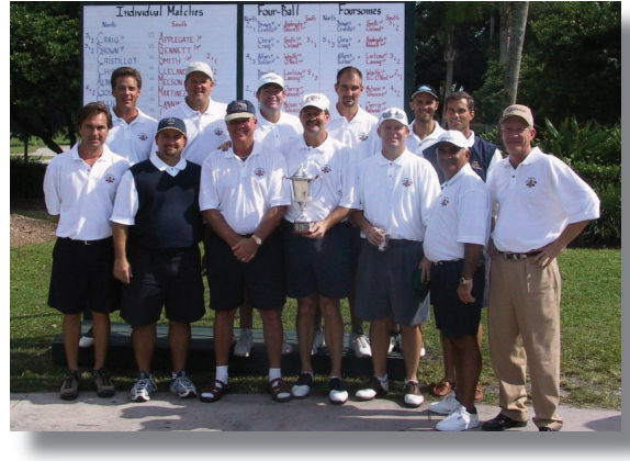
The South Florida team celebrates their win of the 2001 Florida

Keep playing those tournaments to earn points for the Florida Cup and next year's Southeast Challenge.